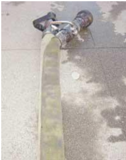
(3) The 1 3/4-inch hose allows significantly higher flow than the 1 1/2-inch line, yet size and weight differences are nominal.

nozzle operator changes the flow setting, the pump operator must be informed so he can adjust pump discharge pressure to the appropriate level for the selected flow. It is possible to put the flow-selection ring on the wrong setting, resulting in the nozzle's flowing less than the desired amount of water. So, in addition to the possibility of introducing a dangerous fog stream into the fire environment, there is a great potential to produce a flow that is less than the acceptable minimum. The adjustable-gallage nozzle is 12 1/4 inches long and weighs 5.6 pounds. The adjust-able-gallage nozzle should not be part of an engine company's nozzle inventory.